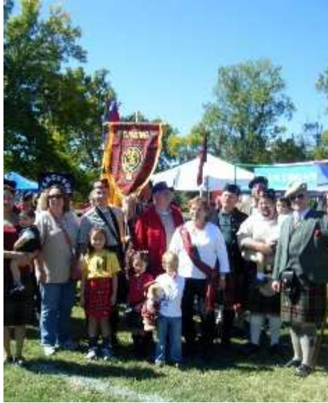
Annual general meeting of Clan Cumming Society of the United States held at Saint Louis, Missouri, on the 1 st day of October, 2011, A.D.